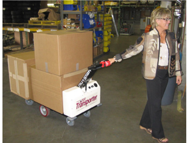
Adjustable-height control handle arm allows operator to push or pull the Transporter.