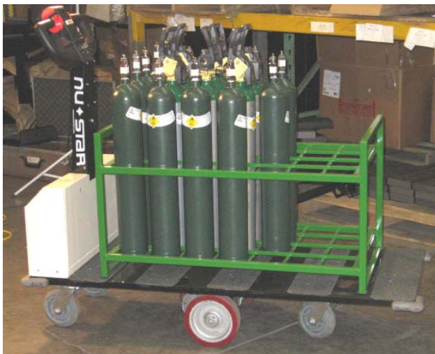
Many facilities have taken advantage of the multi-purpose capacity of the Transporter and its 1600 lbs. load capacity. Shown with an oxygen cylinder rack.